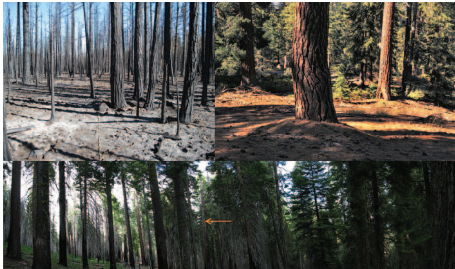
Figure 1. Top left is a California spotted owl Protected Activity Center (PAC) following the 2007 Moonlight wildfire. Top right is a Jeffrey pine with a thick duff layer accumulation around its bole in fire-suppressed mixed conifer. Bottom is a California spotted owl nest in a mixed-conifer forest that burned in a prescribed fire with mixed fire severity in 1997 in Yosemite N.P. Note the nest (shown by arrow) is in an area that burned at low severity and has high canopy closure. The nest is adjacent (<50 ft away) to an area (left one third of the photo) with lower canopy closure that experienced moderate fire severity. (Photo credit: Stephanie Eyes).

This unintended consequence of suppression-focused fire policy is not limited to forest with special designations. A particular problem in many productive, frequent-fire forests is the high duff accumulations that develop around large old trees in the absence of fuels reduction (Figure 1). Long duration smoldering burns can kill even large trees with thick bark (Ryan and Frandsen 1991, Hungerford et al. 1994). An analysis of factors associated with increased mortality found that when duff layers exceeded 5 in., the probability of mortality significantly increased, limiting conditions under which fire can burn without significant large-tree mortality (Hood 2010). The longer that fire is kept out of many productive forests, the greater the likelihood that burn intensity and duration will be higher than desired, im-